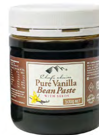
PURE VANILLA BEAN PASTE WITH SEEDS 500g

PRODUCT CODE: EXTRACT074 DIMENSION: L:8.5 x H:11 cms EAN13: 9339337007095 ITF14: 19339337007092 BOX QTY: 4 PC/CTN