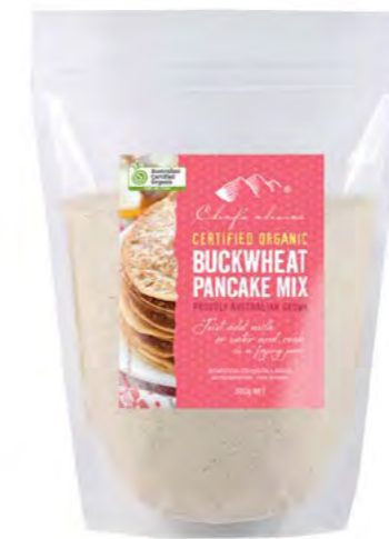
CERTIFIED ORGANIC BUCKWHEAT PANCAKE MIX 500g

PRODUCT CODE: FLOUR020 DIMENSION: L:16 x W:7.5 x H:23 cms EAN13: 9339337003295 ITF14: 19339337003292 BOX QTY: 10 PC/CTN