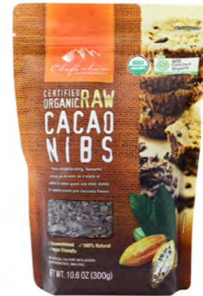
CERTIFIED ORGANIC RAW CACAO NIBS 300g

PRODUCT CODE: CACAO001 DIMENSION: L:16 x W:5 x H:23 cms EAN13: 9339337003448 ITF14: 19339337003445 BOX QTY: 10 PC/CTN