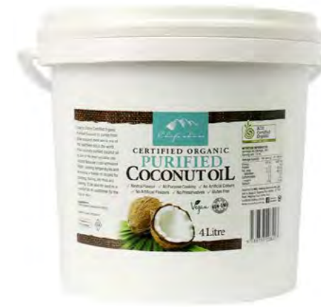
CERTIFIED ORGANIC PURIFIED COCONUT OIL 4L

PRODUCT CODE: OIL028 DIMENSION: L:23.5 x H:20 cms EAN13: 9339337008207 ITF14: 19339337008204 BOX QTY: 4 PC/CTN $36.92