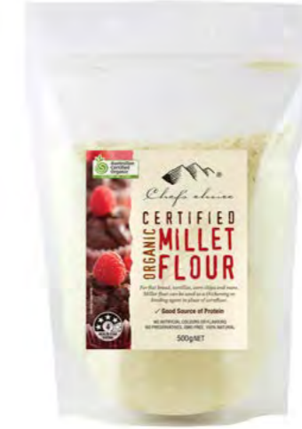
CERTIFIED ORGANIC MILLET FLOUR 500g

PRODUCT CODE: FLOUR013 DIMENSION: L:16 x W:7.5 x H:23 cms EAN13: 9339337001635 ITF14: 19339337001632 BOX QTY: 10 PC/CTN