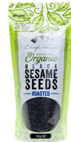
CERTIFIED ORGANIC BLACK SESAME SEEDS ROASTED 150g

PRODUCT CODE: SES002 DIMENSION: L:9.8 x W:20.3 x H:4.5 cms EAN13: 9339337007996 ITF14: 19339337007993 BOX QTY: 15 PC/CTN