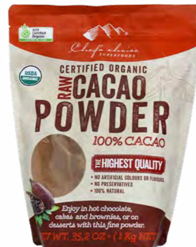
CERTIFIED ORGANIC RAW CACAO POWDER 1kg

PRODUCT CODE: CACAO003 DIMENSION: L:23.5x W:10 x H:34 cms EAN13: 9339337003431 ITF14: 19339337003438 BOX QTY: 10 PC/CTN $28.19