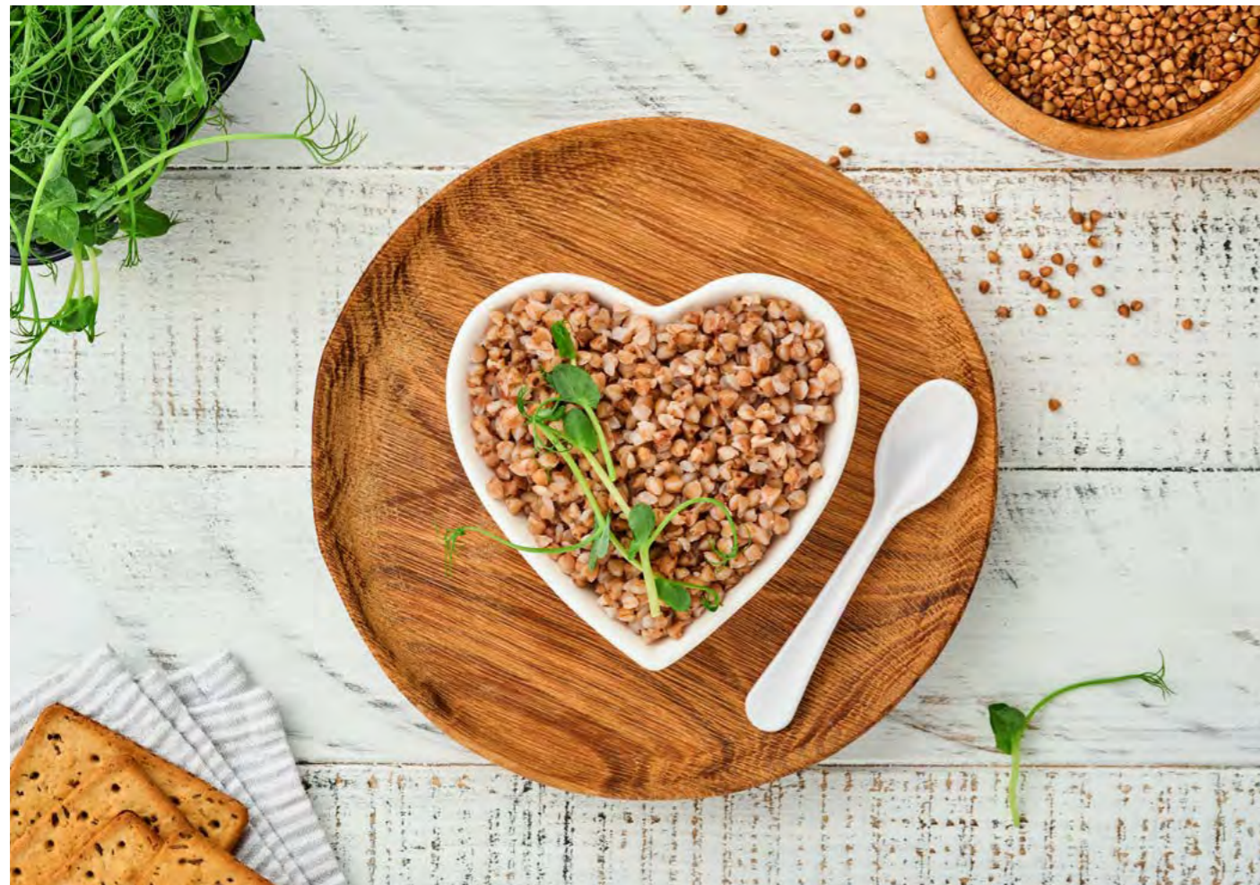
CERTIFIED ORGANIC BUCKWHEAT KERNELS 500g