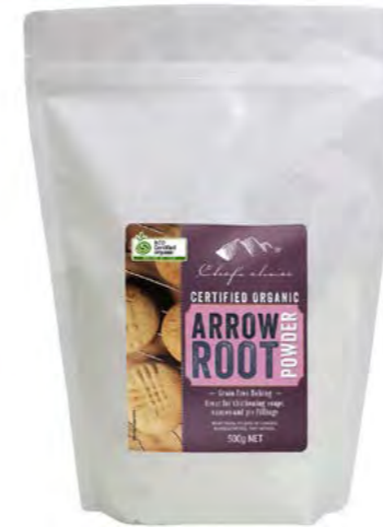
CERTIFIED ORGANIC ARROWROOT POWDER 500g

PRODUCT CODE: ARROW005 DIMENSION: L:13 x W:7x H:24 cms EAN13: 9339337307348 ITF14: 09339337307348 BOX QTY: 10 PC/CTN