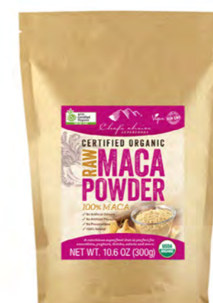
CERTIFIED ORGANIC RAW MACA POWDER 300g

PRODUCT CODE: SUP003 DIMENSION: L:16 x W:8 x H:23 cms EAN13: 9339337004230 ITF14: 19339337004237 BOX QTY: 10 PC/CTN