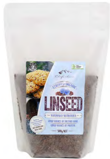
CERTIFIED ORGANIC LINSEED 500g

PRODUCT CODE: LINSEED002 DIMENSION: L:16 x W:7 x H:23 cms EAN13: 9339337305788 ITF14: 19339337305785 BOX QTY: 10 PC/CTN