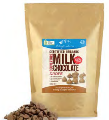
CERTIFIED ORGANIC MILK CHOCOLATE COUVERTURE DROPS 300g

PRODUCT CODE: CACAO010 DIMENSION: L:16 x W:7 x H:23 cms EAN13: 9339337007422 ITF14: 19339337007429 BOX QTY: 10 PC/CTN $15.34