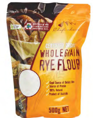
CERTIFIED ORGANIC WHOLEGRAIN RYE FLOUR 500g

PRODUCT CODE: FLOUR014 DIMENSION: L:16 x W:7.5 x H:23 cms EAN13: 9339337001642 ITF14: 19339337001649 BOX QTY: 10 PC/CTN