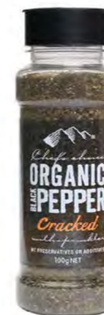
CERTIFIED ORGANIC BLACK PEPPER CRACKED WITH SPRINKLER 100g

It has a sharp yet earthy flavour to give your dishes some wholesome character! White pepper is pickled and processed differently from black pepper, providing a hearty and musty flavour whilst still giving a sharp kick. Enjoy this premium quality whole white pepper over all your dishes!