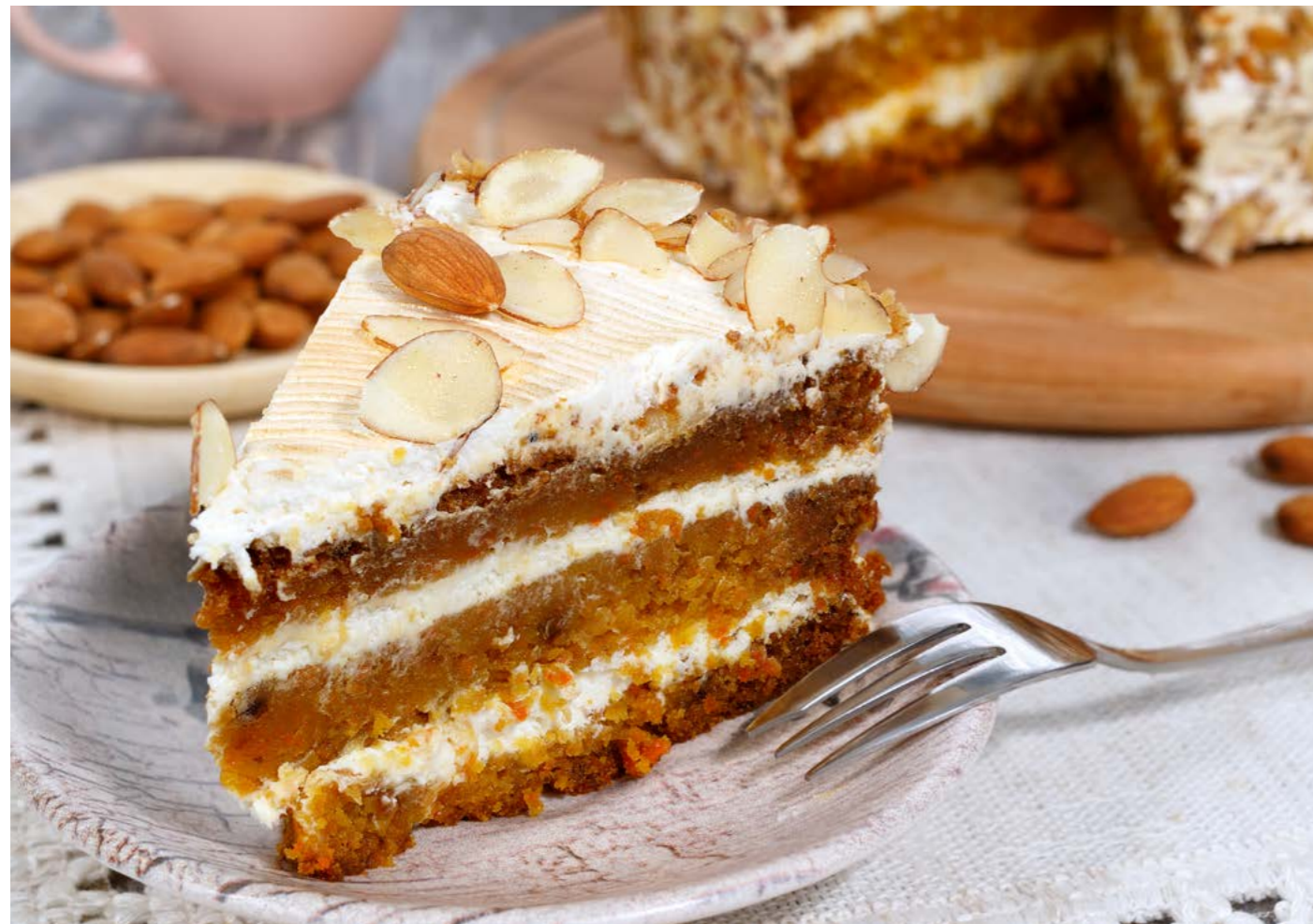
AUSTRALIAN ALMOND MEAL 400g