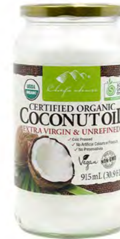
CERTIFIED ORGANIC COCONUT OIL EXTRA VIRGIN & UNREFINED 915ml

PRODUCT CODE: OIL027 DIMENSION: L:9.5 x H:18 cms EAN13: 9339337004933 ITF14: 19339337004930 BOX QTY: 6 PC/CTN $12.78