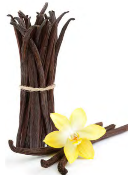
PURE TAHITIAN VANILLA BEANS BULK

For centuries, vanilla beans have been one of the most familiar flavours fundamental to western cuisine. They are commonly used to flavour desserts, beverages, milk products and coffee. Vanilla is one of the most loved flavours of the western palate.