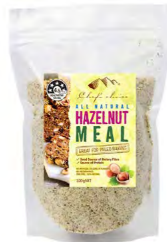
ALL NATURAL HAZELNUT MEAL 320g

PRODUCT CODE: FLOUR039 DIMENSION: L:16 x W:7.5 x H:23 cms EAN13: 9339337006807 ITF14: 19339337006804 BOX QTY: 10 PC/CTN $8.66