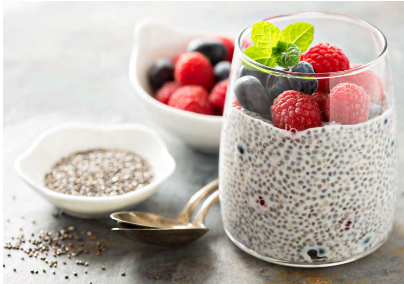
CERTIFIED ORGANIC CHIA SEEDS 150g