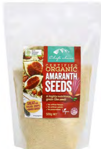
CERTIFIED ORGANIC AMARANTH SEED 500g

PRODUCT CODE: AMAR001U DIMENSION: L:15 x W:6 x H:22 cms EAN13: 9339337300226 ITF14: 19339337300223 BOX QTY: 10 PC/CTN