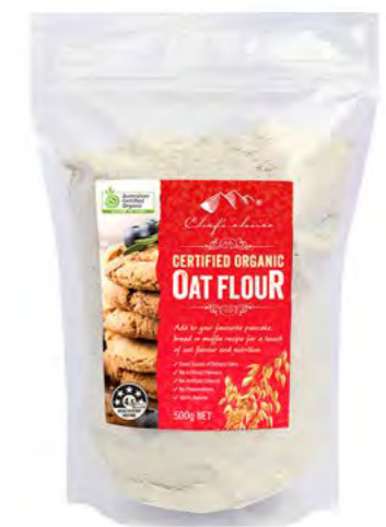
CERTIFIED ORGANIC OAT FLOUR 500g

PRODUCT CODE: OAT002 DIMENSION: L:16 x W:7.5 x H:23 cms EAN13: 9339337006425 ITF14: 19339337006422 BOX QTY: 10 PC/CTN