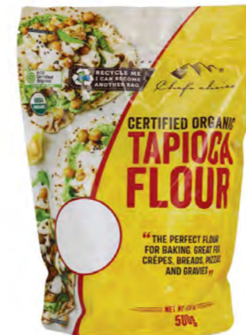
CERTIFIED ORGANIC TAPIOCA FLOUR 500g

PRODUCT CODE: TAPIOCA003U DIMENSION: L:18 x W:7 x H:25 cms EAN13: 9339337304286 ITF14: 19339337304283 BOX QTY: 10 PC/CTN