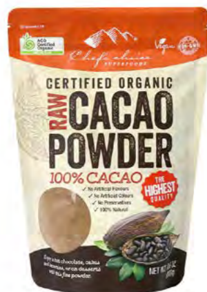
CERTIFIED ORGANIC RAW CACAO POWDER 300g

PRODUCT CODE: CACAO004 DIMENSION: L:16 x W:8 x H:23 cms EAN13: 9339337003424 ITF14: 19339337003421 BOX QTY: 10 PC/CTN $9.59