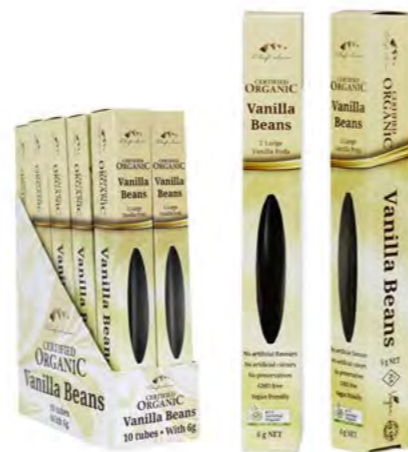
CERTIFIED ORGANIC VANILLA BEANS 6g

PRODUCT CODE: VBST DIMENSION: L:2.5 W:2.5 x H:19.2 cms EAN13: 9339337000454 ITF14: 29339337000458 BOX QTY: 10 PC/CTN