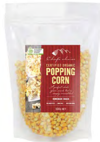
CERTIFIED ORGANIC POPPING CORN 500g

PRODUCT CODE: CORN004 DIMENSION: L:16 x W:7.5 x H:23 cms EAN13: 9339337001178 ITF14: 19339337001175 BOX QTY: 10 PC/CTN