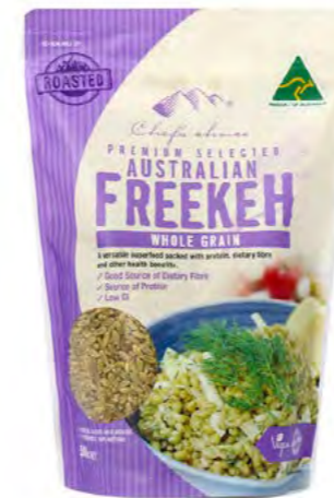
PREMIUM SELECTED AUSTRALIAN ROASTED FREEKEH WHOLE GRAIN 500g

PRODUCT CODE: FREEKEH003U DIMENSION: L:16 x W:7.5 x H:23 cms EAN13: 9339337007941 ITF14: 19339337007948 BOX QTY: 10 PC/CTN