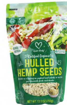
LOVIN' BODY CERTIFIED ORGANIC HULLED HEMP SEED 350g

PRODUCT CODE: HEMP001U DIMENSION: L:15 x W:6 x H:22 cms EAN13: 9339337008832 ITF14: 19339337008839 BOX QTY: 10 PC/CTN