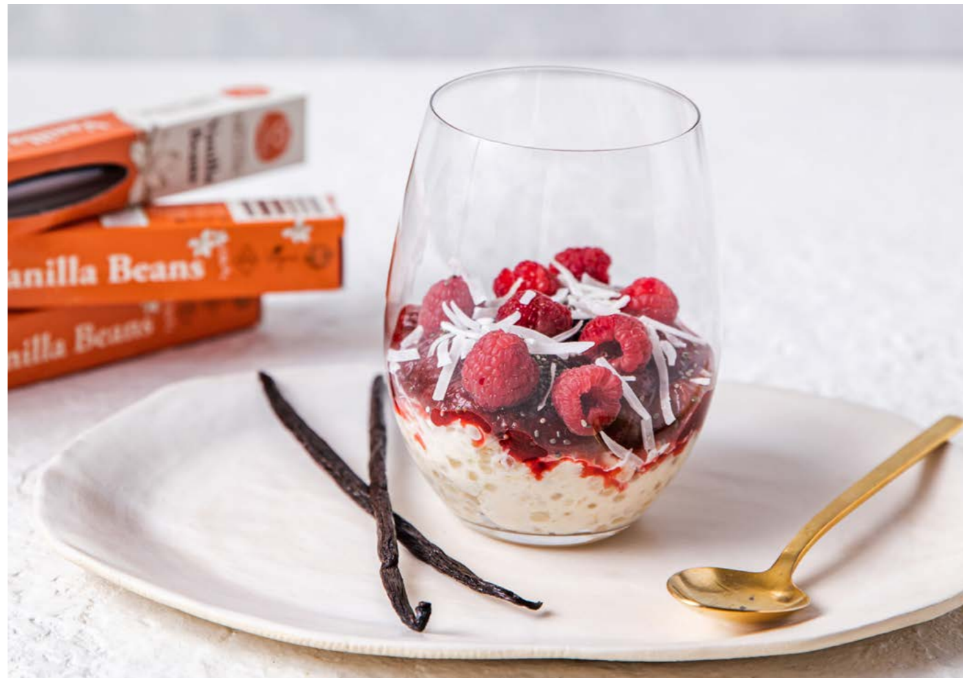
CERTIFIED ORGANIC VANILLA SINGLE BEANS 3g