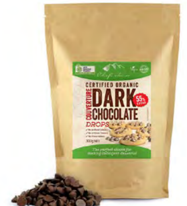
CERTIFIED ORGANIC DARK CHOCOLATE COUVERTURE DROPS 55% CACAO 300g

PRODUCT CODE: CACAO009 DIMENSION: L:16 x W:7 x H:23 cms EAN13: 9339337302879 ITF14: 19339337302876 BOX QTY: 10 PC/CTN $13.06