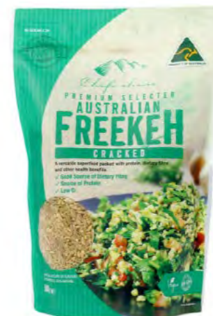
PREMIUM SELECTED AUSTRALIAN ROASTED FREEKEH CRACKED 500g

PRODUCT CODE: FREEKEH004U DIMENSION: L:16 x W:7.5 x H:23 cms EAN13: 9339337007934 ITF14: 19339337007931 BOX QTY: 10 PC/CTN