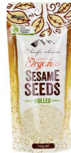
CERTIFIED ORGANIC SESAME SEEDS HULLED 140g

PRODUCT CODE: SES003 DIMENSION: L:10 x W:20.5 x H:5 cms EAN13: 9339337007989 ITF14: 19339337007986 BOX QTY: 15 PC/CTN