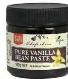
PURE VANILLA BEAN PASTE WITH SEEDS 100g

PRODUCT CODE: EXTRACT023 DIMENSION: L:5.8 x H:6 cms EAN13: 9339337300035 ITF14: 19339337300032 BOX QTY: 12 PC/CTN