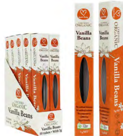
LOVIN' BODY CERTIFIED ORGANIC VANILLA BEANS 3g

PRODUCT CODE: LOVIN019 DIMENSION: L:2.5 W:2.5 x H:19.2 cms EAN13: 9339337307232 ITF14: 29339337307236 BOX QTY: 10 PC/CTN