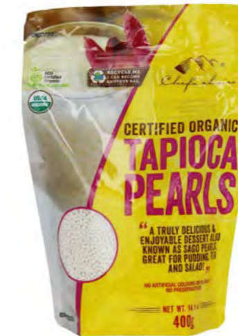
CERTIFIED ORGANIC TAPIOCA PEARLS 400g

PRODUCT CODE: TAPIOCA002U DIMENSION: L:15 x W:6 x H:22 cms EAN13: 9339337009242 ITF14: 19339337009249 BOX QTY: 10 PC/CTN